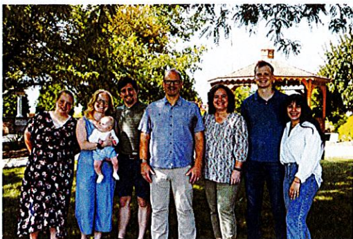
The Ziebarth Family

For details on program locations , start dates , and meeting times please visit our website or contact your CIA School Coordinator for more information.