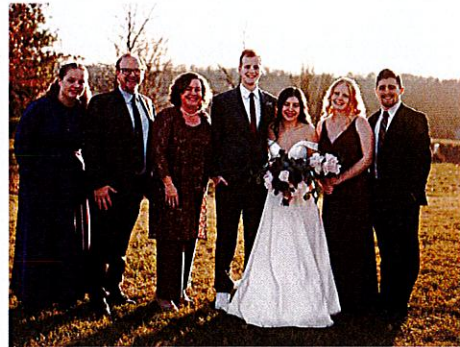
The Ziebarth Family

For details on program locations , start dates , and meeting times please visit our website or contact your CIA School Coordinator for more information.