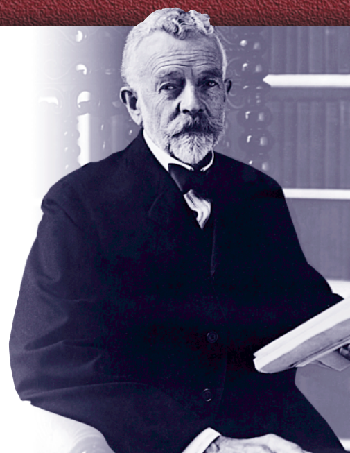
Senator Henry Cabot Lodge (1850–1924) opposed U.S. entry into the League of Nations.

Speeches like Lodge's helped turn the public against the League and gave President Wilson the most crushing defeat of his political career. In this section, you will learn how the United States and Europe adjusted to the end of the war.