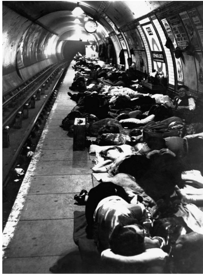
British civilians sleep in a subway station being used as an air raid shelter during the Battle of Britain in 1940.

German planes also unleashed massive bombing attacks on London and other civilian targets. By September, however, the Battle of Britain had left Hitler frustrated. The RAF was holding off the Luftwaffe. And despite constant bombing, the British people did not surrender.