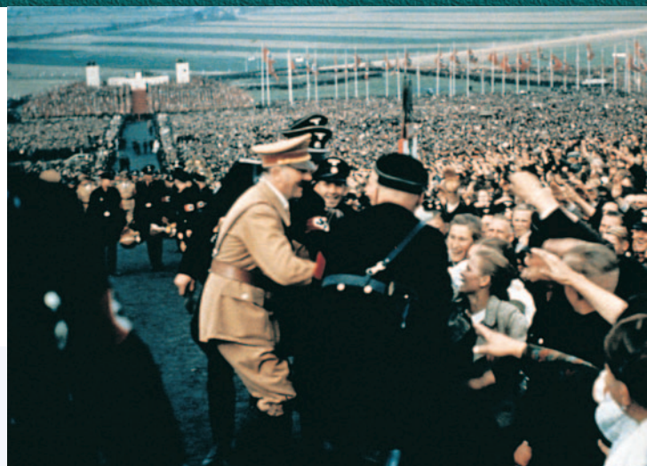
Adolf Hitler greets a crowd of more than one million people at a Harvest Festival in 1937.