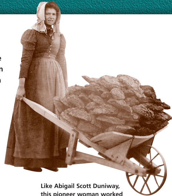
Like Abigail Scott Duniway, this pioneer woman worked long and hard. She is shown here with buffalo chips she has collected on the treeless prairie to use as fuel.

Oregon honored Duniway for her part in the suffrage struggle by registering her as the state’s first woman voter. As you will read in this section, women like Duniway helped to shape the West.