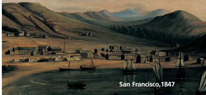
San Francisco, 1847