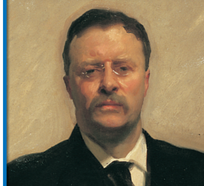
THEODORE ROOSEVELT 1858–1919

From his youth on, Theodore Roosevelt lived what he called the “strenuous life.” He rode horses, hiked, boxed, wrestled, and played tennis. In winter, he swam in the icy Potomac River. He hunted rhinoceros in Africa, harpooned devilfish in Florida, and boated down the Amazon.