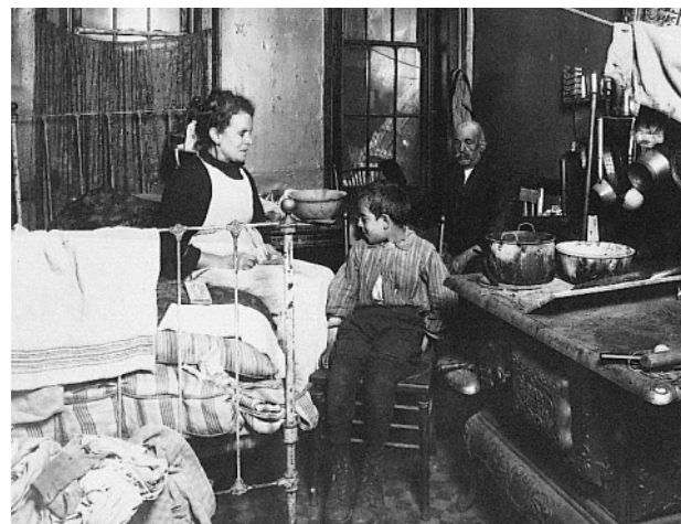
This photograph shows an immigrant family in a crowded tenement at the turn of the century.

Another group of reformers who wanted to improve social welfare were the prohibitionists. They worked to prevent alcohol from ruining people's lives. The prohibitionists built on the temperance movement of the 1800s.