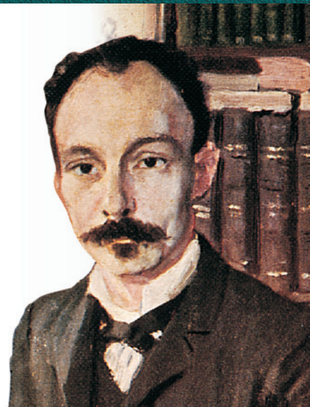
José Martí dedicated his life to the Cuban struggle for independence from Spain.

Martí's lifelong struggle for Cuban independence made him a symbol of liberty throughout Latin America. In this section, you will read how U.S. disapproval of Spain's treatment of Cubans led to the Spanish-American War.