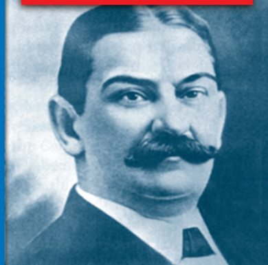
LUIS MUÑOZ RIVERA